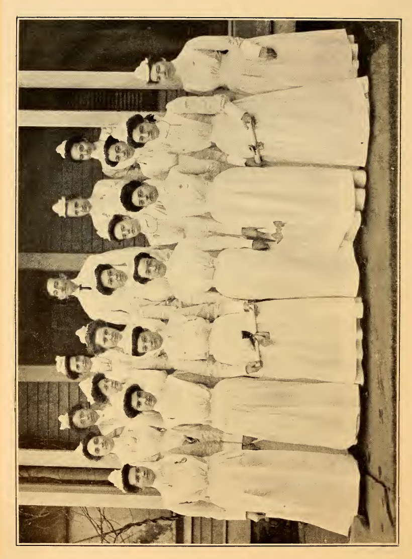
REPRESENTATIVE GROUP, CLASS OF '03.